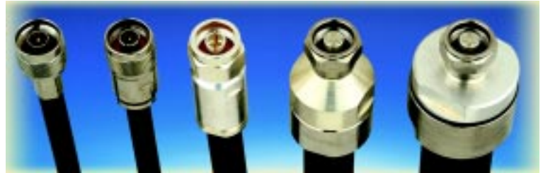
CN400, CN440S, CN600, CN900, CN1200