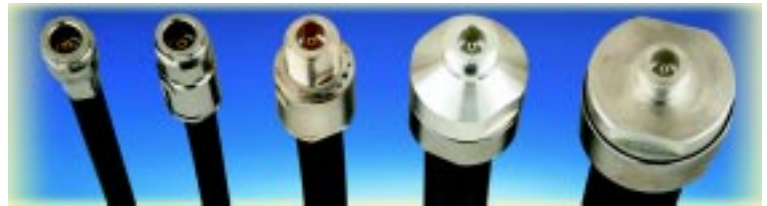
CNF400, CNF400S, CNF600, CNF900, CNF1200