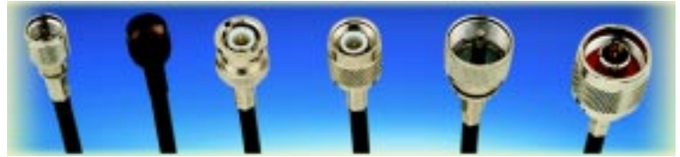
CMUHF58, CBMUHF58, CBNC58, CTNC58, CPL9C, CN58