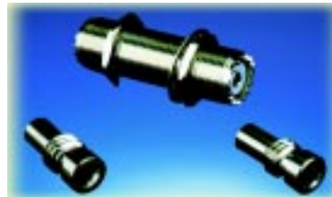
CUG175, CPL9CFF, CUG176