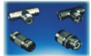
CPL9F3, CNF3 CNFNF, CNUHFF

Notes: Other connectors may be available - call or visit http://www.antenex.com for items not listed. There is a 50 piece minimum on special order nonstock items. Connectors for RG58 also fit ANTENEX® Teflex™ and Teflon® coax. Connectors for LMR™ 400 will fit 9913 coax.