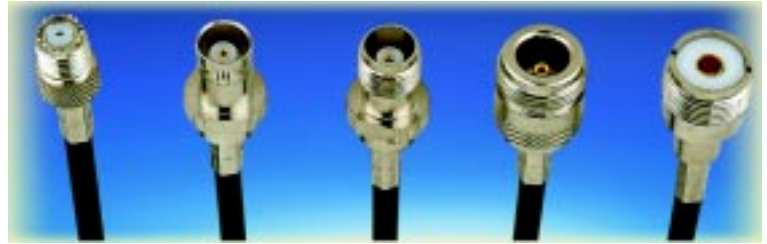
CMUHFF58, CBNCF58, CTNC58F, CNF58, CPL9CF